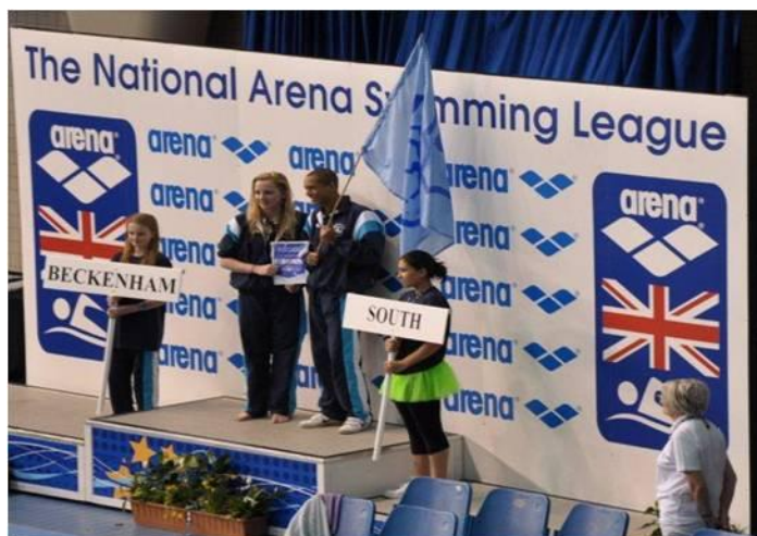
Proudly representing South.....