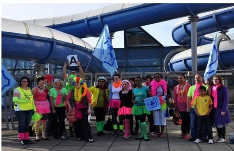
Some interesting parental costumes.....