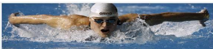
The National Arena Swimming League

17 th April, 2011. An unseasonably warm day dawned for the London marathon, BUT, much further north in Sheffield, the Beckenham 'barmy blue army' descended, and took part in a keenly fought contest in the Arena National league "B" Final coming 8 th - and narrowly not coming 7 th . The full results can be found on the Arena web-site.